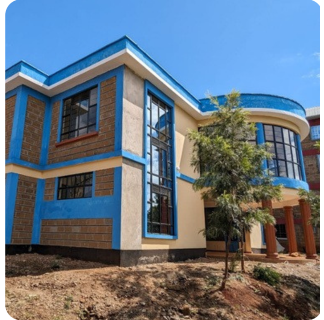
Chuka Ultra Modern Public Library and Youth Resource Center